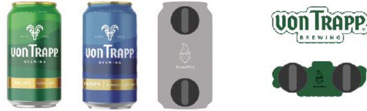
CUSTOM PINS - $1.80 / $0.90 Coop