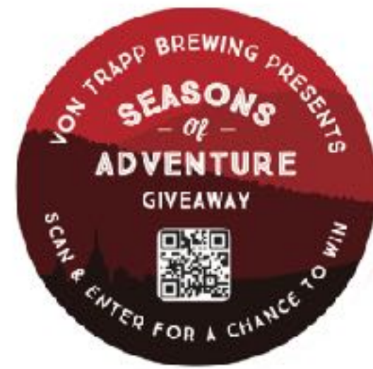
SEASON OF ADVENTURE STICKERS $2.10/Roll. / $1.05/Roll Coop