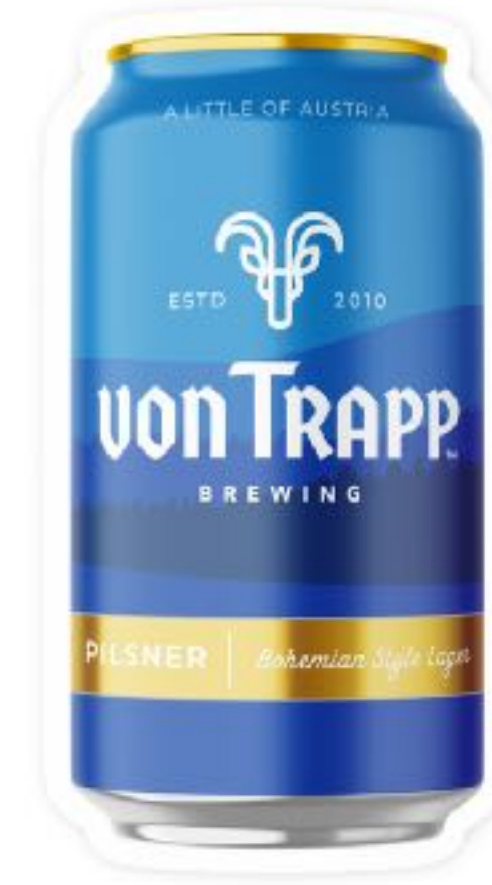
TIN TACKERS - $30 / $15 Coop