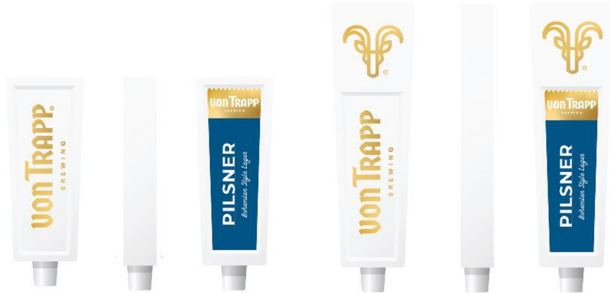
TAP HANDLES - $26 / $13 Coop