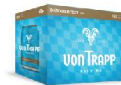
12-PK 12 OZ. CAN SKU: 850052988043