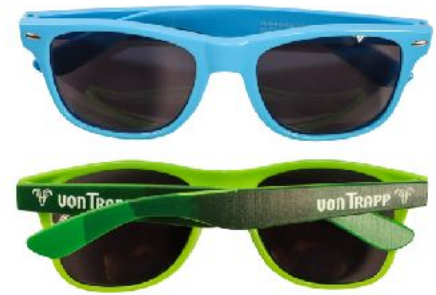
SUNGLASSES - $2.73 / $1.37 Coop