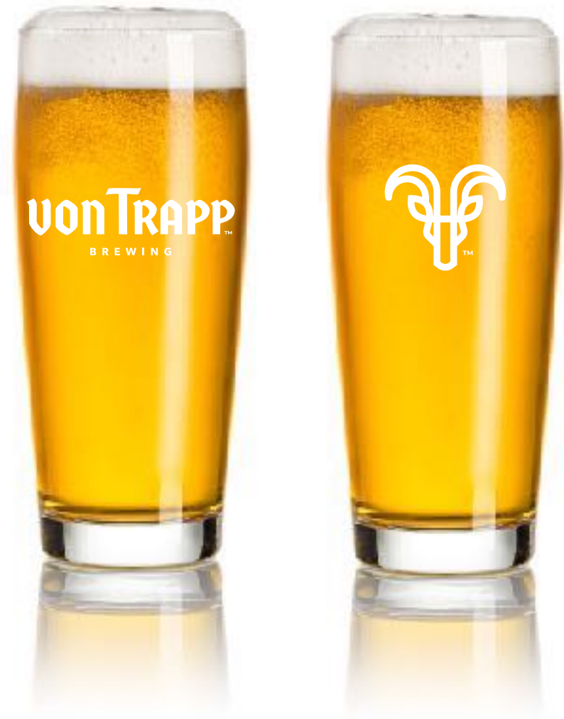
GLASSWARE - Inquire for pricing