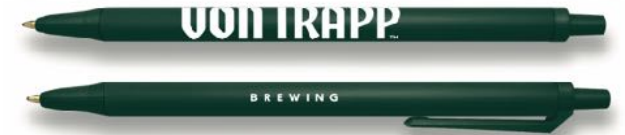
LOGO PENS - $0.60 / $0.30 Coop