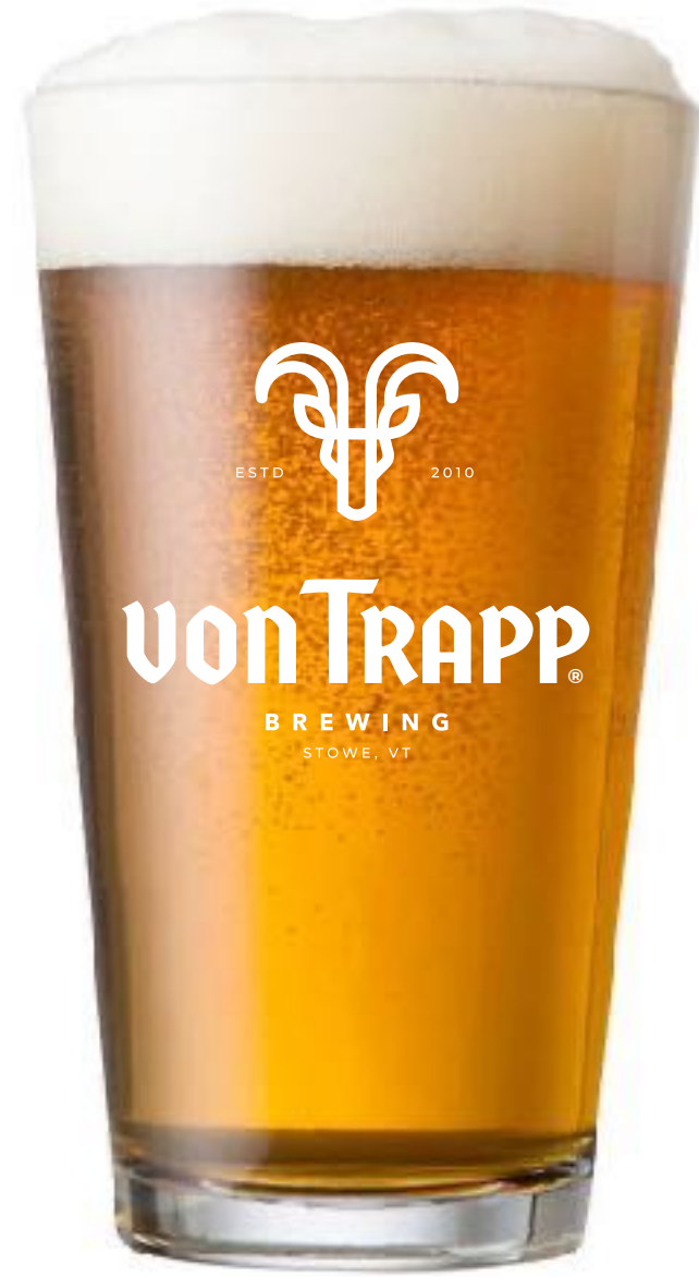
PINT GLASSES $38.00/case 24 units/case