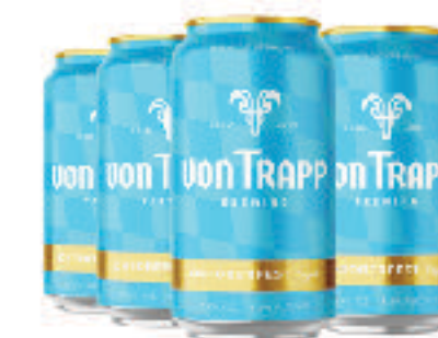
6-PK 12 OZ. CAN SKU: 850052988111