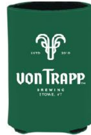
KOOZIES - $1.80 / $0.90 Coop