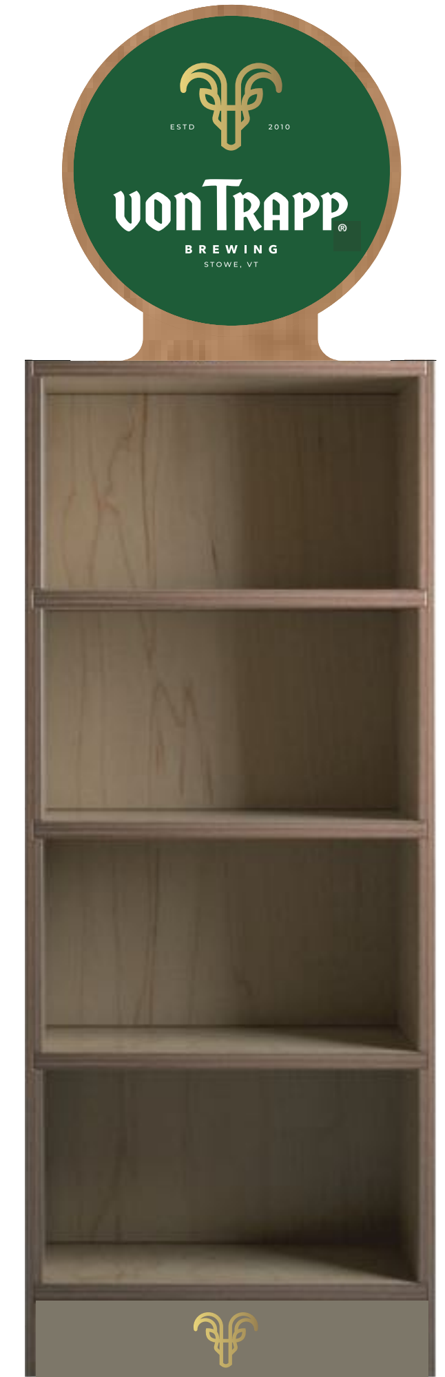
POP DISPLAY STACKER - $50 / $25 Coop